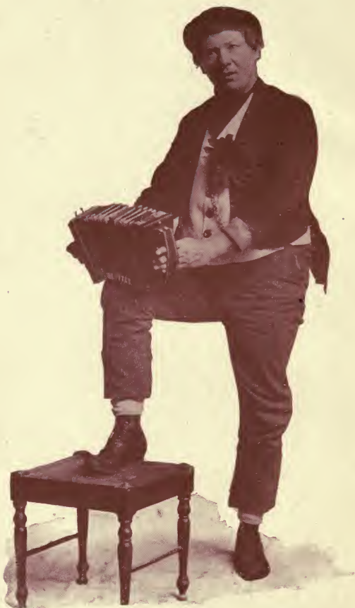
The Norsk Nightingale